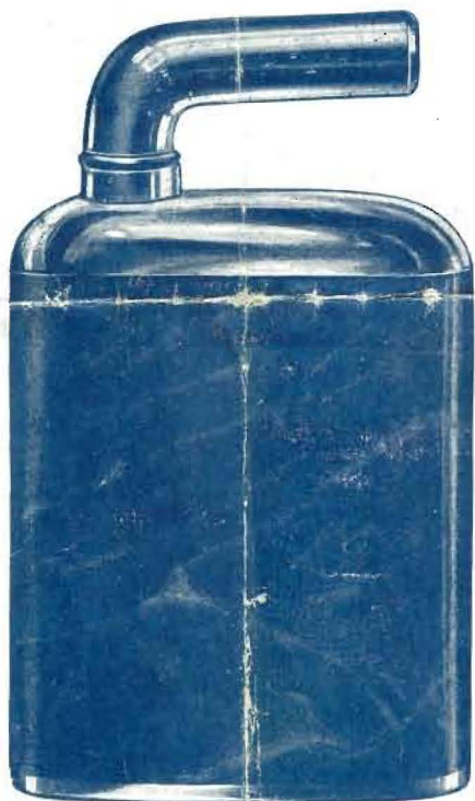
The MEGAPHONE (Real Size)